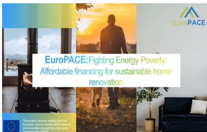
Figure 5. Fighting Energy Poverty: Affordable financing for sustainable home renovation Event Graphic

This forum, organized by Joule Assets Europe within the auspices of the EuroPACE project, aimed to raise awareness on the importance of accessing finance for domestic refurbishment and why this should be considered a significant social justice issue in the European Union member states. The event, held on March 26 th of 2020, was part of EuroPACE’s WP4 “Deploy - Olot Pilot” and so its objective focuses on implementing the pilot in Olot, based on the foundations of WP3.