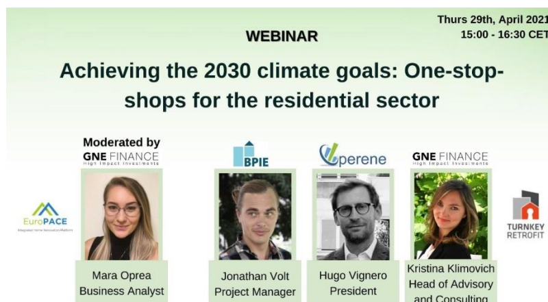
Figure 10. Achieving the 2030 climate goals: One-stop-shops for the residential Event Graphic

The building sector is responsible for more than one third of the European Union’s carbon emissions, yet only 1% of buildings undergo energy efficiency renovations per year, with the deep renovation rate being at a staggering 0.2%. As such, renovation activity needs to increase considerably to put the sector on track for meeting the region’s 2030 climate goals. During this webinar, BPIE and GNE Finance addressed this issue