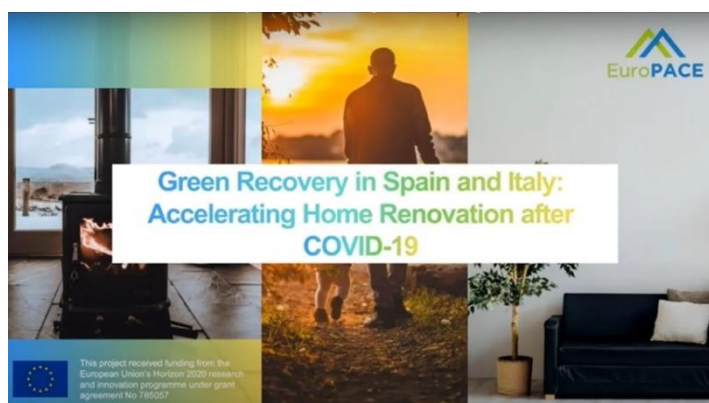
Figure 6. Green Recovery in Spain and Italy: Accelerating Home Renovation after COVID-19 Event Graphic

This event, organized by Joule Assets, discussed current policies accelerating home renovation as well as the financing tools pushing them forward. Via the presentation of case studies, it focused on the renovation environment in Spain and the stimulus efforts within Italy. The webinar held on 22 nd of September 2020, is part of the EuroPACE’s WP5 “Dissemination, Community & Stakeholder Engagement” with the objective to promote the EuroPACE initiative to a wider audience across EU.