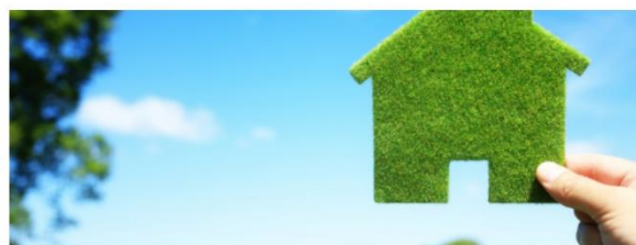
Home renovation in Europe: The User Perspective

The event took place so as to disseminate the efforts of EuroPACE's WP2 "Market Review", the objective of which is to define the EuroPACE Adoption Roadmap by countries and cities. This session achieved the WP2 initial goal by presenting the EuroPACE initiative before the project launch (March 2018), demonstrating how cities and region can start and replicate similar initiatives. As well as presenting the initiative, which enabled to set the scene for other countries and cities.