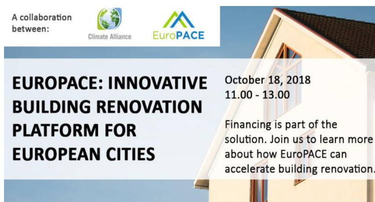
Figure 1. EuroPACE: Innovative Building Renovation Platform for EU Cities Event Graphic

The recording of this event can be found here .