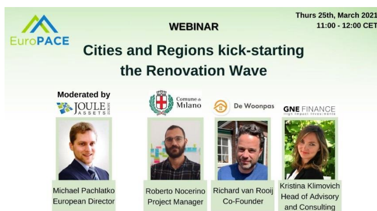
Figure 8. Cities and Regions kick-starting the Renovation Wave Event Graphic

Successful home renovation programs from the Netherlands, Spain, and Italy were presented. These programs collectively address holistic assistance, affordable financing, and effective customer engagement while utilizing an innovative financing mechanism. In the Netherlands, debt is decoupled from the owner and attached to a property. In Spain and Italy, credit enhancement solutions are put in place to ensure affordable financing.