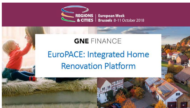
Figure 7. Effective Home Renovation Programmes Event Graphic

The event, held on the 20 th of October 2020, was held as a part of EuroPACE’s WP3 “Design – Pilot Project”, it’s the objective of which was to communicate the production of a set-up and design manual for EuroPACE implementation programs at the city level. The webinar was organized by GNE Finance with support from Ente Vasco de la Energia (EVE). The event took place during the 18 th European Week of Regions and Cities (2020), an annual four-day event during which cities and regions showcase their capacity to create growth and jobs, implement European Union cohesion policy, and prove the importance of the local and regional level for good European governance. This annual event is a unique communication and networking platform which enables to discuss common challenges for Europe’s regions and cities and examine possible solutions, bringing together regions and cities from all over Europe, including politicians, administrators, experts and academics.