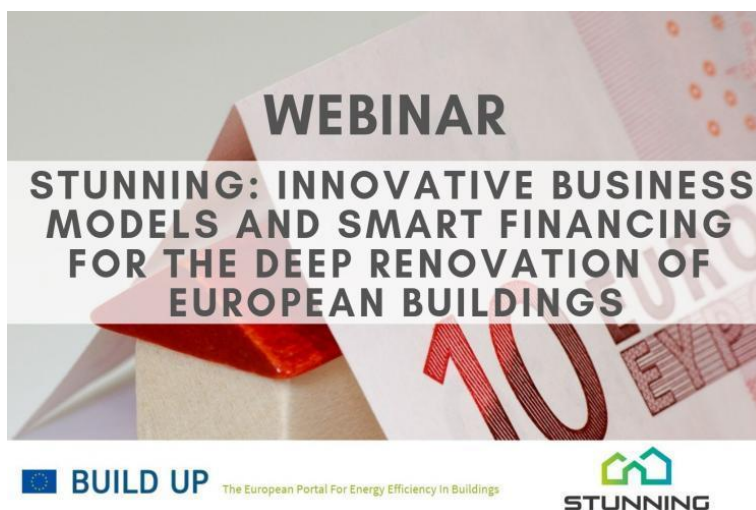
Figure 4. Innovative business models and smart financing Event Graphic

The recording of this event can be found here .