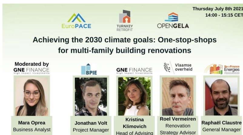
Figure 11. Achieving the 2030 climate goals: One-stop-shops for multi-family building renovations Event Graphic

When submitting the proposal, it was initially believed that it would be beneficial to have a forum presenting the results of the leader’s cities of the project. Instead of focusing on the leader’s cities and their results, as these have been addressed during the EuroPACE Closing Summit, held in May and June 2021, the event had a specific focus on achieving the 2030 climate goals through one-stop-shops to enable energy efficient home renovation in the multi-family building sector. Multi-family buildings represent 47% of residential dwellings in the EU. However, the sector remains largely overlooked in terms of sustainable renovations and energy retrofits, despite a growing need for them. As such,