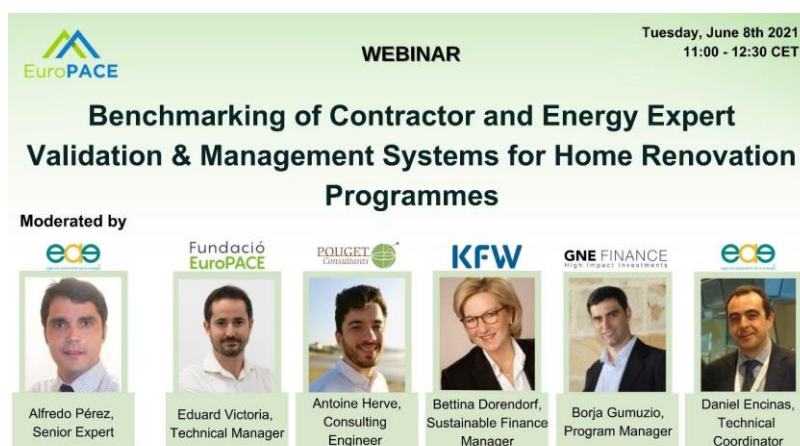
Figure 9. Benchmarking of Contractor and Energy Expert Validation & Management Systems for Home Renovation Programmes Event Graphic

This webinar explored how different European home renovation programmes deal with the management and validation of contractors and energy experts, as well as their related works and services. It included the processes, selection procedures, quality guarantees and tools used to assess their competence and the quality of their services.