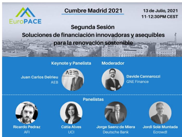
Figure 15. Banner used to promote the second session and the speakers attending

has shown the most commitment and innovation up to the present day. Institutions with a proactive profile stand out with proposals, ideas and are open to explore public-private collaborations to design financial instruments capable of handling a large loan portfolio. The recording of the session can be found here .