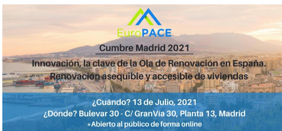
Figure 11. Banner used for promotion of Cumbre Madrid 2021

Innovation and strong collaboration between public and private actors are key to make the Renovation Wave a reality in Spain. This cooperation is the cornerstone for achieving the region's and country's climate goals for 2030 and 2050.