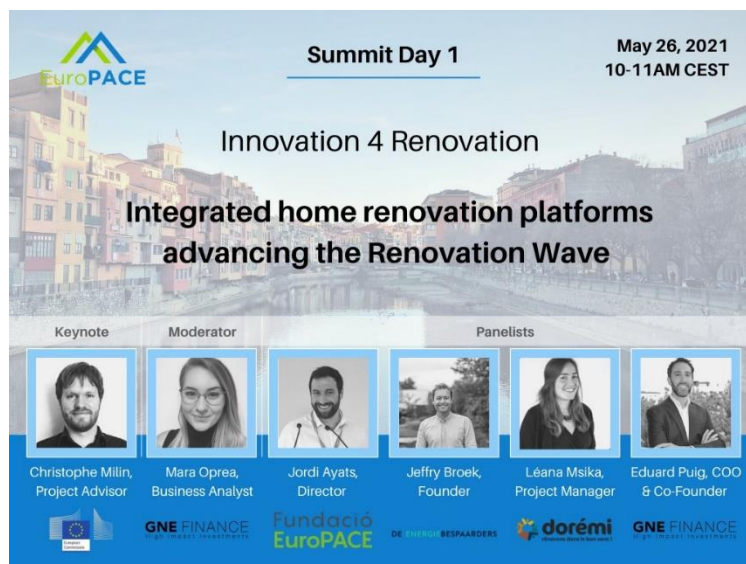
Figure 8. First day of the summit banner with the assisting speakers

This session focused on the impact that one-stop-shops have had on the European renovation rate, featuring successful initiatives from OSS programs including HolaDomus, De Energiebespaarders, and Dorémi. In addition, it approached methods to overcome barriers which commonly impede the uptake of private household renovations, including knowledge deficits, financial barriers, market failure and value chain fragmentation, and regulatory challenges. The recording of the event can be found here .