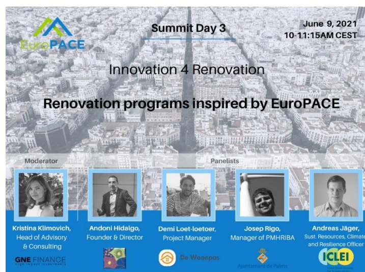
Figure 10. Banner of the third day of the summit with the respective speakers.

This session was centered on one-stop-shop’s replication potential within the EU, with a focus on EuroPACE replication. The Opengela, REGENERATE, and FITHOME models inspired by the PACE and EuroPACE concepts were presented, and gave insight to local citizen-centric replication. The recording of the event can be found here .