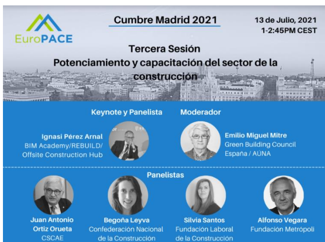
Figure 16. Banner used to promote the third session and the speakers attending

This session talked about the current situation of the construction sector and the existing gap to achieve the climate goals for 2030 and 2050. Special emphasis was placed on innovations, digitization, best practices and barriers to reduce this gap and achieve the objectives of the Renovation Wave in Spain.