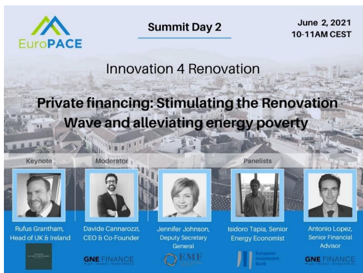
Figure 9. Banner of the second day of the summit with the respective speakers

Within this session, several topics were discussed including attracting private investment stakeholders to the renovation business, increasing the volume of operations, the blending of public and private investments, various ways of using EU recovery funds to support renovation, green mortgages, creating efficient financing instruments that are accessible to most people, and more. The recording of the event can be found here .