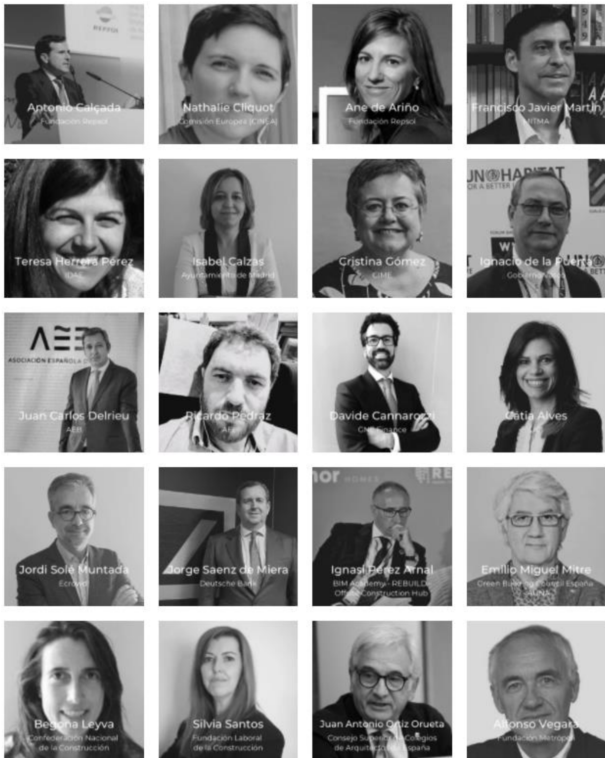
Figure 12. Speakers attending the Cumbre Madrid 2021 with their associated organizations