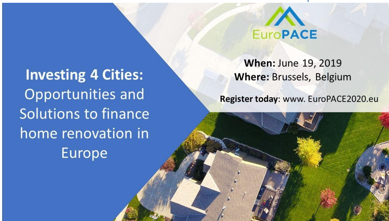
Figure 3. Banner used to promote the EuroPACE Summit 2019

After more than one year since the start of the project, the Consortium was more ambitious when planning the second summit. On the one hand, the intention was to organise it within the biggest EU event on sustainable energy, the EUSEW 2019, but on the other hand, a slot in the official programme provided less time than required for the summit. Thus, the consortium decided to organise a full day event in Brussels, linked to EUSEW 2019 as an Energy Day.