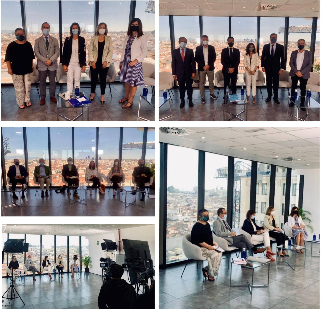
Figure 17. Pictures from the live event in Madrid

Renovation Wave gets as much impulse as possible. The recording of the session can be found here .