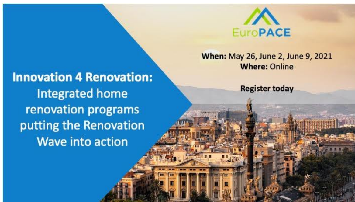
Figure 7. Banner used for the promotion of EuroPACE Summit 2021

The situation after March 2020 and the COVID-19 pandemic was a barrier for the organisation of the third summit. The Consortium postponed the event until 2021, with the belief that by that time the situation allowed the organisation of a face-to-face event. Unfortunately the conditions didn't change significantly over time and by the beginning of 2021 the Consortium took the decision of shifting to an on-line format.