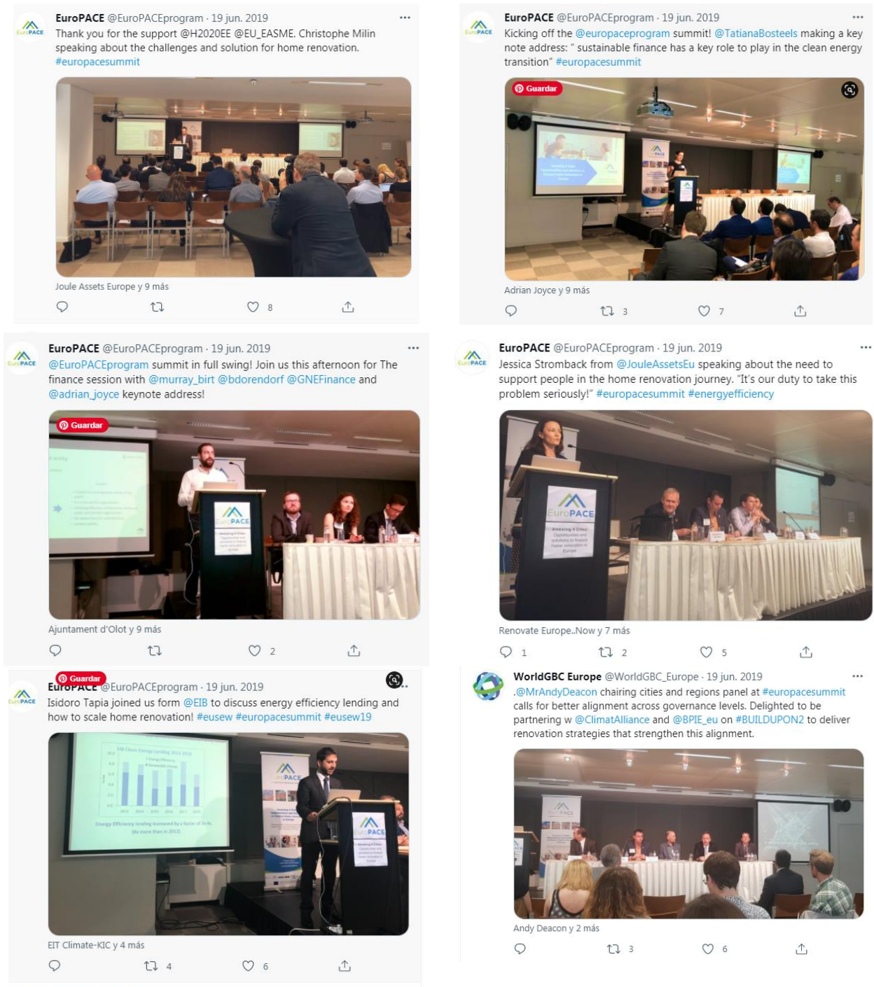
Figure 6. Twitter content related to the EuroPACE Summit 2019