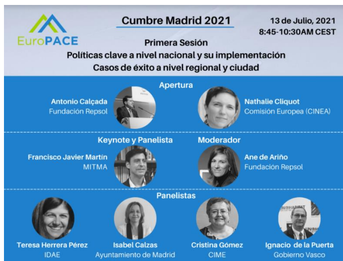
Figure 14. Banner used to promote the first session and the speakers attending

This session presented the policy framework for eco-sustainable renovation and how these policies have driven success stories in cities and regions in Spain. It also delved into best practices and main barriers to scaling up success stories (city-region-country transition).