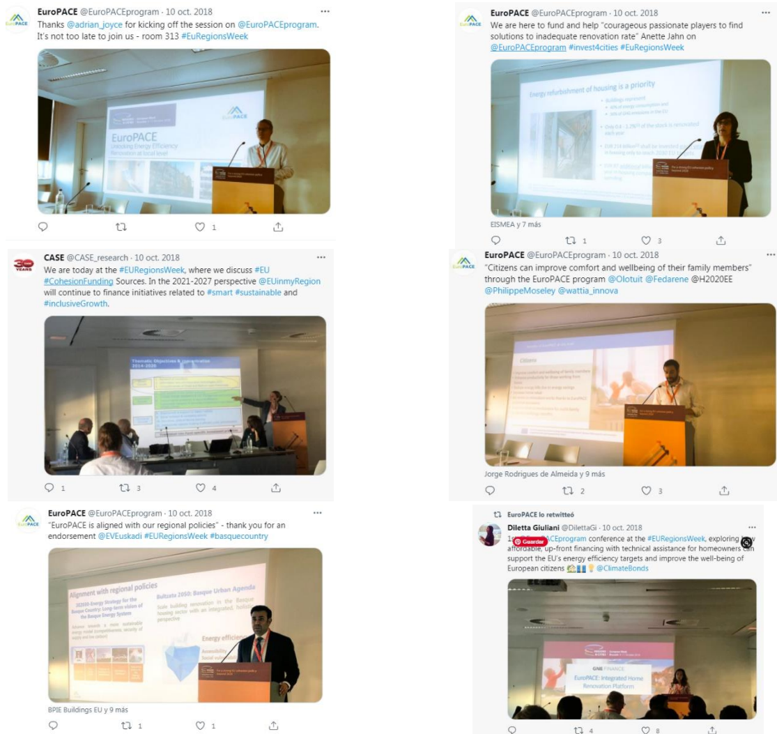
Figure 2. Tweets related to EuroPACE

The event created a positive momentum and generated new connections with potential Leader Cities.